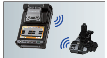
Auto blade rotating