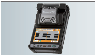
Large cleave angle error