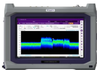
CellAdvisor 5G Cell site test solution