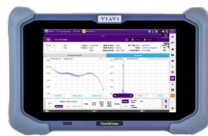
OneAdvisor-800 All-in-One Cell-site Installation and Maintenance Test Solution