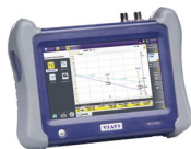
T-BERD/MTS-5800 Handheld test instrument for testing 10 G Ethernet and fiber networks