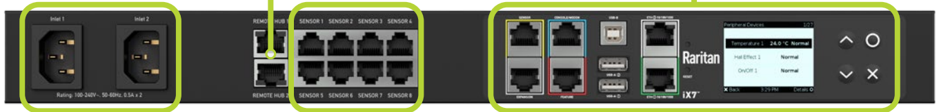
Model Shown: SRC-0800

The iX7 controller provides a future-proof design, with more computing power, higher efficiency processors, a host of extra ports, and standard Gigabit Ethernet.